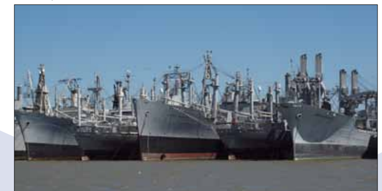
Ghost Fleet ships in Suisun Bay await cleanup and removal.

With the agency's rapid progress in cleaning and disposing of these ships, the Ghost Fleet is steadily becoming a smaller threat to the health of the Bay and local wildlife. We'll keep you updated as work progresses and this major source of pollution to the Bay is finally removed.