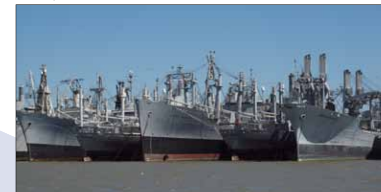
Ghost Fleet ships in Suisun Bay await cleanup and removal.

With the agency's rapid progress in cleaning and disposing of these ships, the Ghost Fleet is steadily becoming a smaller threat to the health of the Bay and local wildlife. We'll keep you updated as work progresses and this major source of pollution to the Bay is finally removed.